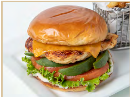
CALIFORNIA CHICKEN CLUB

ALL-AMERICAN BURGER* Angus beef, double American cheese, mustard, ketchup and pickles on a toasted brioche bun 18.99 | ADD BACON +3