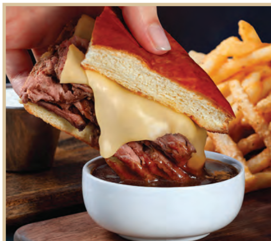
TOM'S FAMOUS PRIME RIB DIP

Our crowd pleasing favorites, crafted to perfection and loved by all!