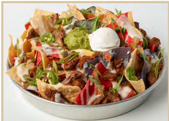
DEEP-DISH ADOBO CHICKEN NACHOS