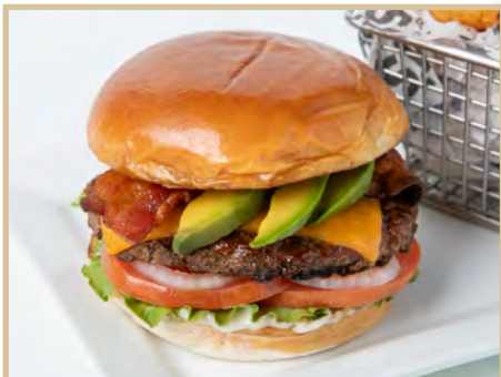
BACON AVOCADO BURGER

IMPOSSIBLE BURGER (VG) Plant-based patty, lettuce, tomato, onion, served on a vegan bun 19.49