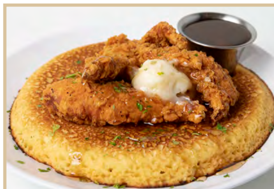
CRISPY CHICKEN & CORNBREAD PANCAKE

FISH & CHIPS Beer-battered whitefish with fries and a side of coleslaw 20.99