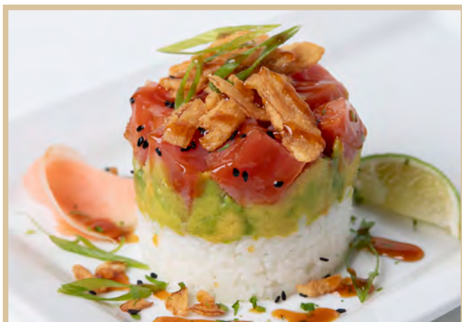
AHI TUNA TOWER

CHEESE CURDS Fried cheese curds with a side of marinara and ranch dressing 12.99